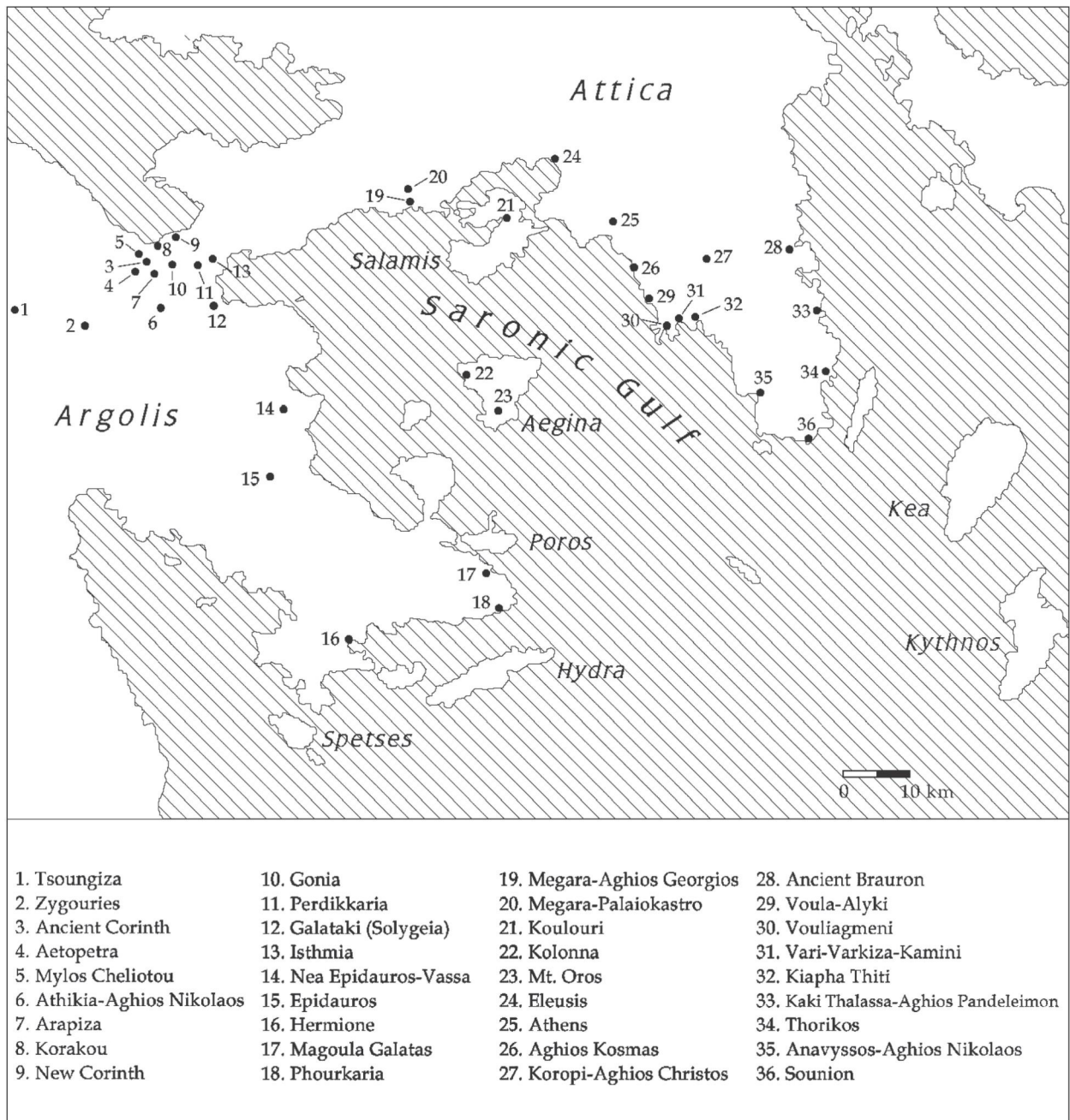
Fig. 1. The Saronic Gulf. The Early Mycenaean period (P. Berezowski)

This region of dynamic trade certainly played a significant role in the history of the period. The principal centre of this exchange, particularly in the Early Mycenaean period, was Aegina. It seems likely that the settlements located on the coasts of the Saronic Gulf participated in the distribution of pottery and other objects imported from distant parts of the Aegean world. They were also involved in the transfer and propagation of ideas reaching Mycenaean Greece through the Saronic Gulf.